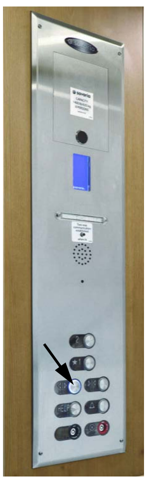
Figure 3 Door Open Button

When the elevator is at a landing level, the doors can be opened by pressing the Door Open button. Normally the doors will have opened and already closed automatically. The Door Open button allows the door to be reopened.